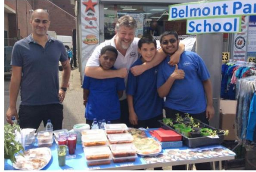
Students from The Lammas School, Norlington School and Belmont Park School in Waltham Forest sold their produce in Walthamstow Market as part of the Know Your Onions programme.